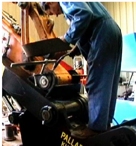
Pic 4 Adapter rotating / lifting

Adapter will be raised and rotated against sticks booms under plate. Care must be taken that the Adapter and Stick are properly aligned.