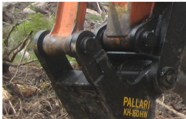
Pic 6. Head ear assembly.

Shaft and lock-doughnuts has to installed between H-link and head ears