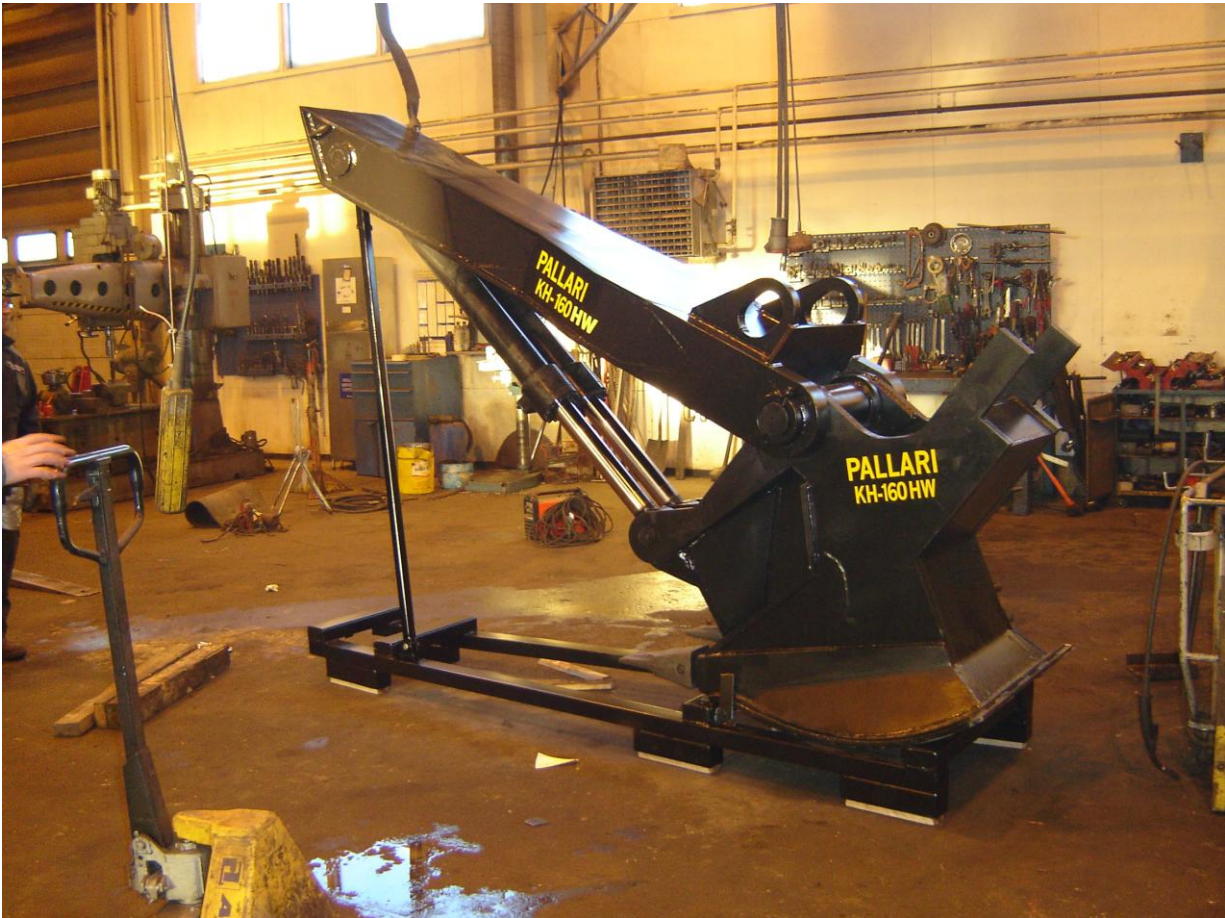
Pic 1 Assembly unit

Head, adapter and blade has to pre-install as shown on pic 1.