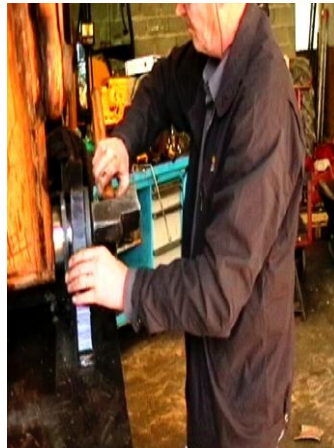
Pic 3: Measuring the mid line of adapter.

Adapter will be raised and rotated against sticks booms under plate. Care must be taken that the Adapter and Stick are properly aligned.