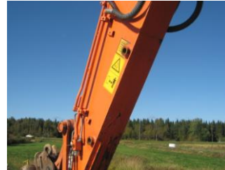
Pic 5. Support pin/bushing-set for the adapter. (Required weldings 4 sets.)