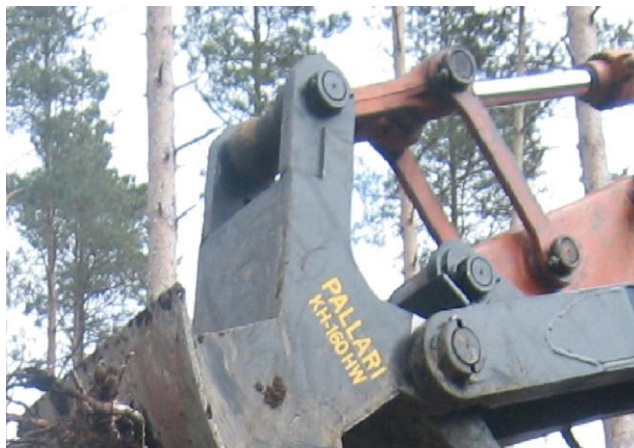
Pic 2 Adapter and head assembly

Shaft and lock-doughnuts has to installed between adapter ears.